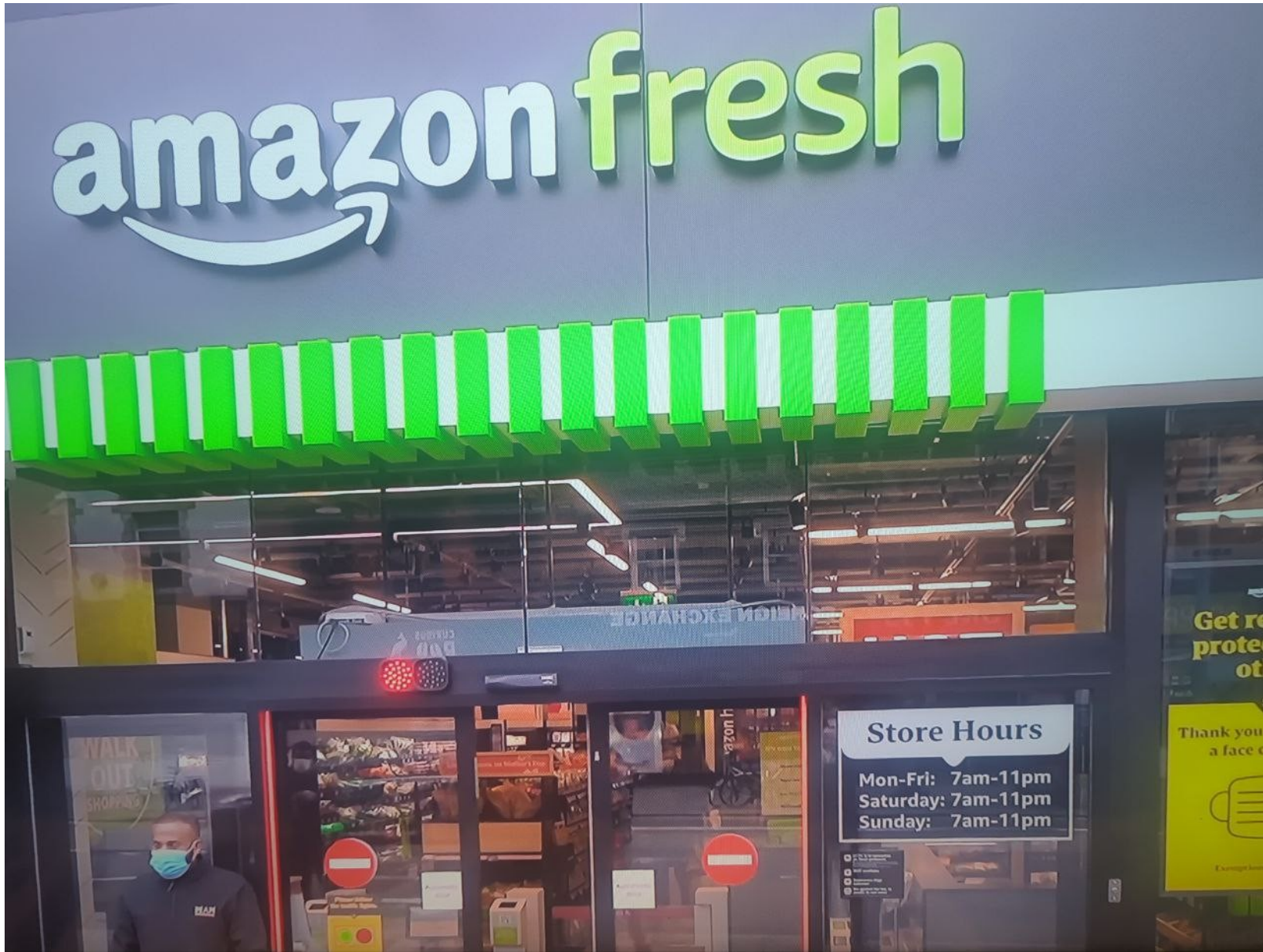
Amazon Fresh “Just Walk Out” Stores, Suspended April 2024 “AI” checkout was actually powered by 1,000 human video reviewers in India.