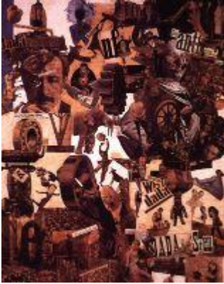
Hannah Hoch, Schnitt mit dem Küchenmesser Dada durch die letzte Weimarer Bierbauchkulturepoche , 1920

Although New Media art is, on one level, all about the new -- new cultural forms, new technologies, new twists on familiar political issues -- it did not arise in an art historical vacuum. The conceptual and aesthetic roots of New Media art extend back to the second decade of the twentieth century, when the Dada movement emerged in several European cities. Dada artists in Zürich, Berlin, Cologne, Paris, and New York were disturbed by what they perceived as the self-destructive bourgeois hubris that led to the First World War, and began to experiment with radically new artistic practices and ideas, many of which resurfaced in various forms and references throughout the twentieth century. Much as Dada was in part a reaction to the industrialization of warfare and the mechanical reproduction of texts and images, New Media art can be seen as a response to the information technology revolution and the digitization of cultural forms.