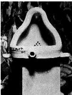
Marcel Duchamp, Fountain , 1917/1964

For all these reasons -- the emergence of a global art scene, advances in information technology, and the familiarity of computing to a rising generation -- artists were drawn to New Media art from other disciplines. Previously, computer-based art had been a marginal field