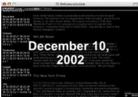
MTAA, OnKawaraUpdate , 2001

of live performances in which he reworks D.W. Griffith's controversial 1915 film Birth of A Nation while assembling an improvised soundtrack out of layers of sampled sound.