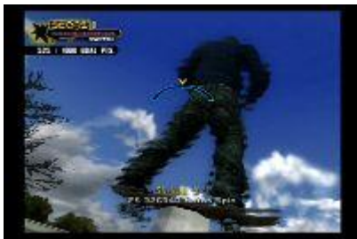
RSG, Prepared PlayStation , 2005