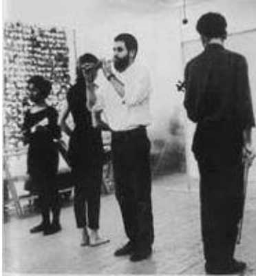
Allan Kaprow, 18 Happenings in 6 Parts , 1959

the fall of the Iron Curtain and the collapse of Soviet Union, artists in that region had a unique perspective on the Internet's dot-com era transformation -- they were living in societies making the transition from Socialism to Capitalism, a phenomenon that in many ways mirrored the privatization of the Internet.