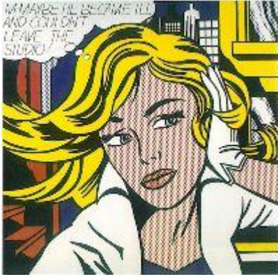
Roy Lichtenstein, M-Maybe , 1965

themselves from the popular culture that inspired them. In contrast, New Media artists tend to work with the very media from which they borrow (e.g. games) rather than transposing them into forms that fit more neatly within art world conventions.