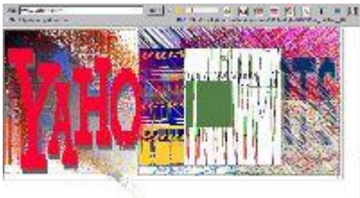
Mark Napier, FEED , 2001

While the art of the 1970s was defined by distinct movements (e.g., Conceptual art, Feminist art, Land art, Media art, Performance art), the 1980s gave rise to an overheated art market and a plethora of micro-movements. Many of these, such as Neo-Expressionism and Neo-Conceptualism, were postmodern recuperations of previous moments in art history. After the art market crash that followed "Black Monday" (October 19, 1987, the day the United States' stock markets collapsed), these micro-movements lost their momentum and, by the early 1990s, had largely run their course, leaving a conspicuous void (although trends, such as identity politics and large-scale photography, could be identified). Fed by the growth of Masters of Fine Arts programs and supported by the expansion of museums, contemporary art continued to thrive, but artistic practices did not cohere into definable movements. Painting was declared dead by critics, collectors, and artists alike, as video and installation came to dominate international museum and biennial exhibitions. It was against this background of extreme fragmentation that New Media art emerged at end of the twentieth century.