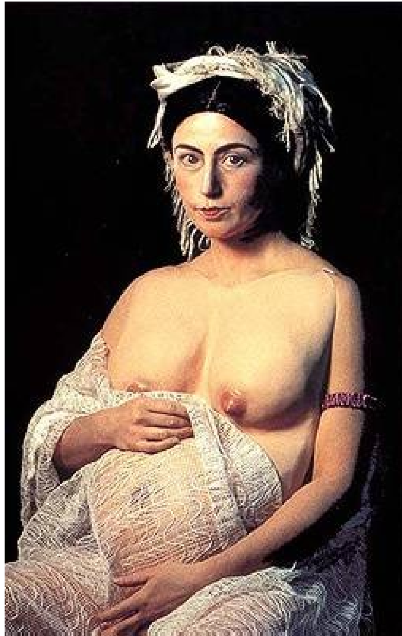
Cindy Sherman, Untitled 230 1990