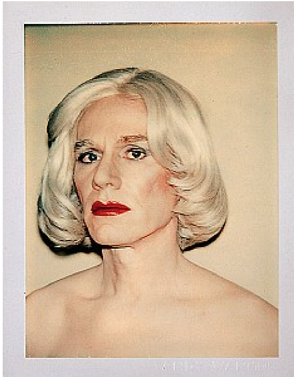
Andy Warhol, Self-Portrait (in Drag), 1981. Polaroid print