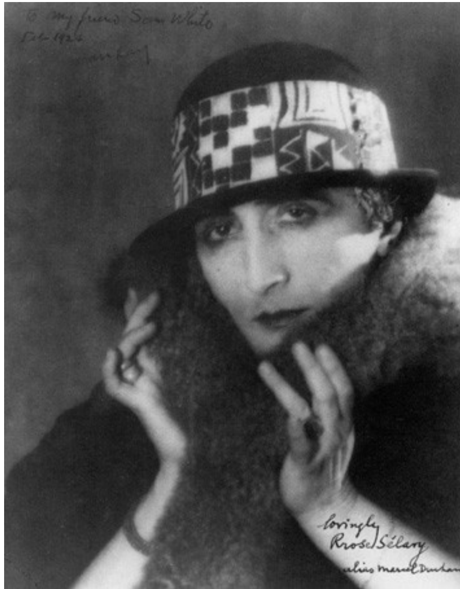
Rose Sélavy (Marcel Duchamp). 1921. Photograph by Man Ray. Art direction by Marcel Duchamp. Silver print. 5-7/8" x 3-7/8". Philadelphia Museum of Art.