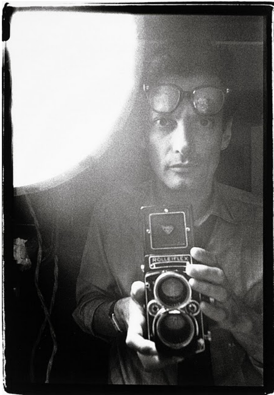
Richard Avedon Self-Portrait, c. 1963