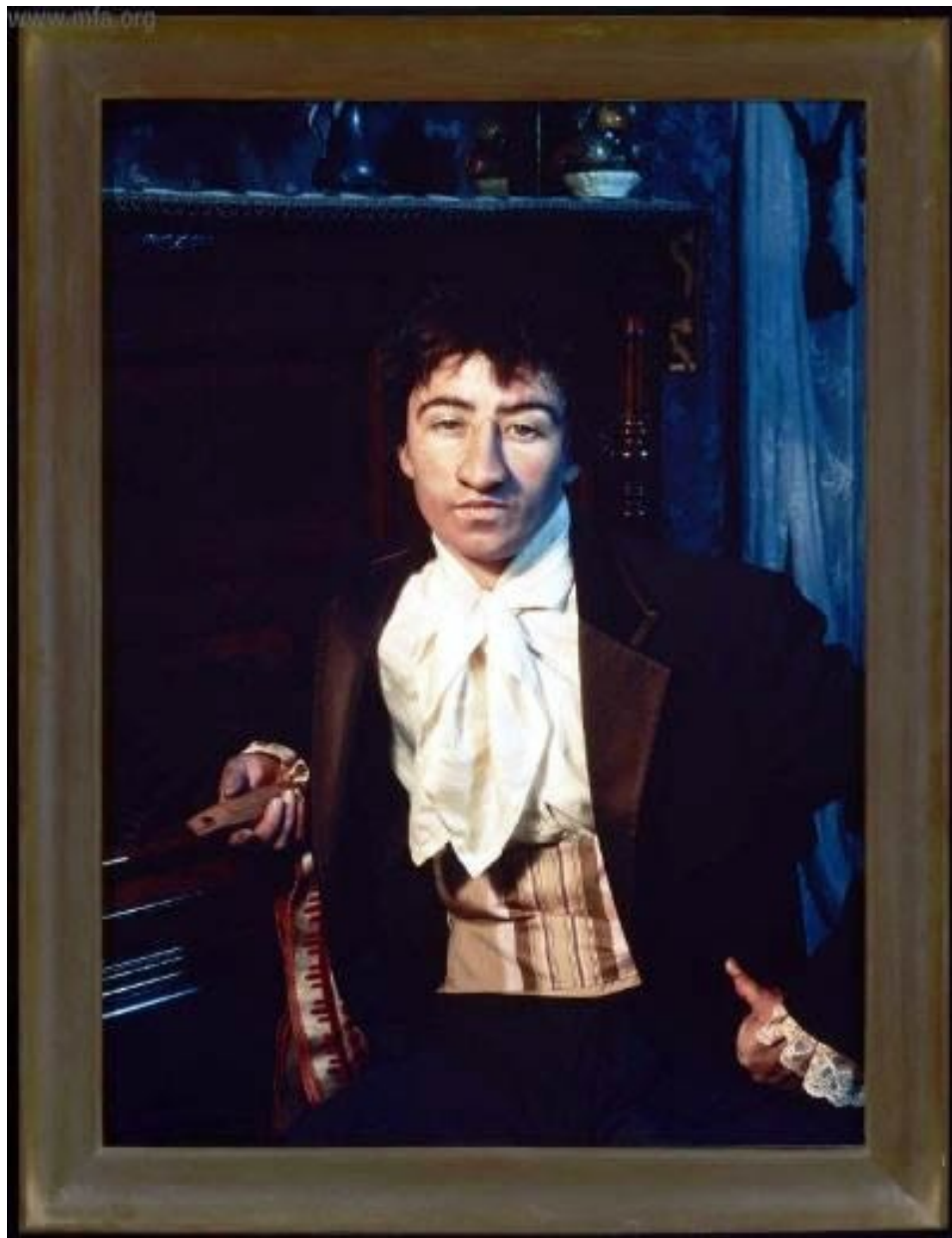
Cindy Sherman, Untitled 203 1989