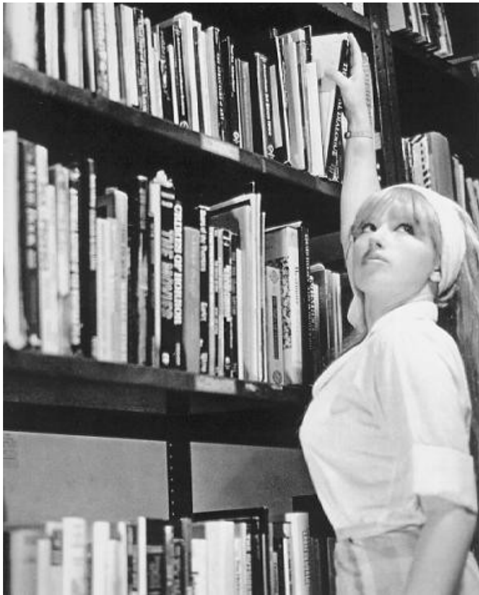
Cindy Sherman, Untitled Film Still 13 1978