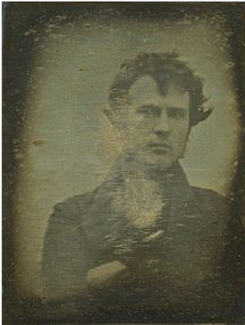
Robert Cornelius, self-portrait, Oct. or Nov. 1839 , approximate quarter plate daguerreotype. The back reads, "The first light picture ever taken." This self-portrait is the first photographic portrait image of a human ever produced.