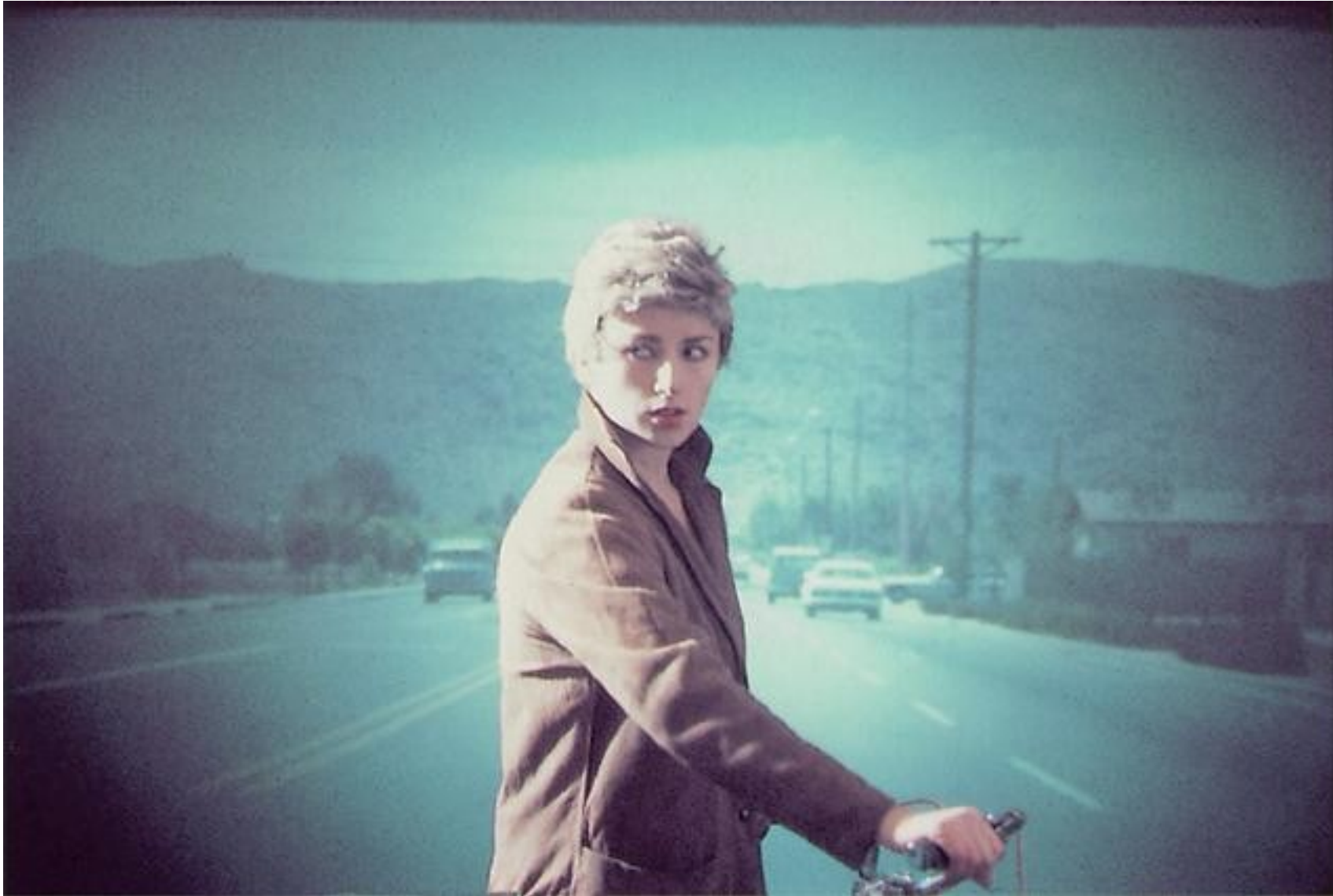
Cindy Sherman, Untitled Film Still 66 1980