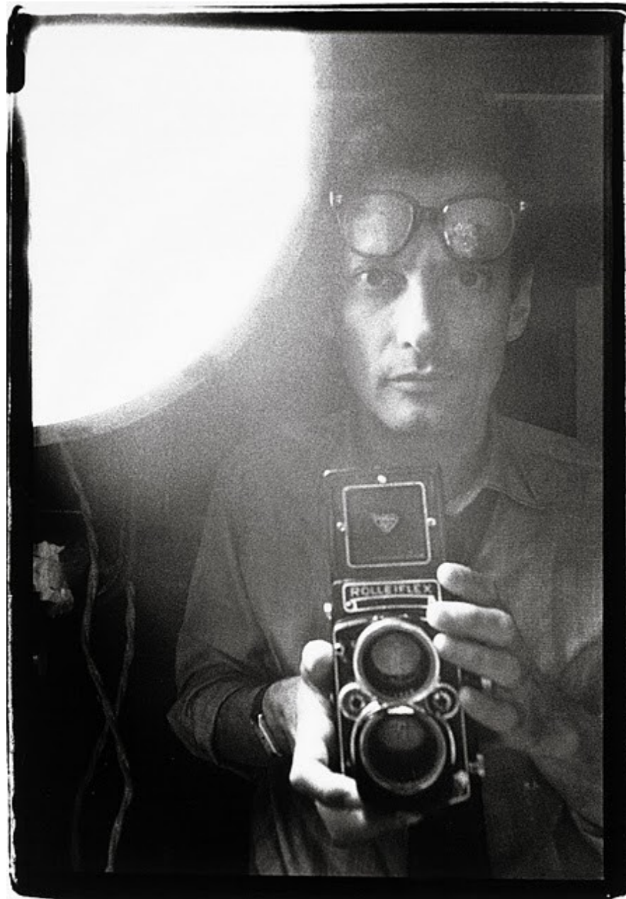
Richard Avedon Self-Portrait, c. 1963