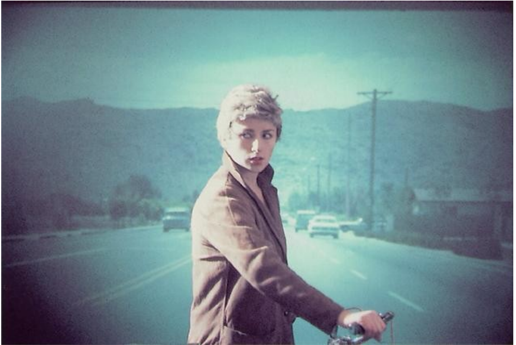
Cindy Sherman, Untitled Film Still 66 1980